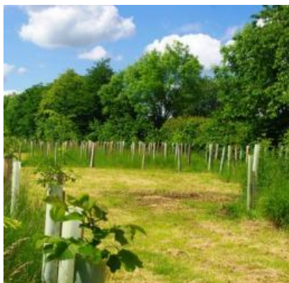
planning a new woodland