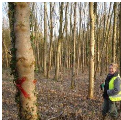
selection of trees for thinning