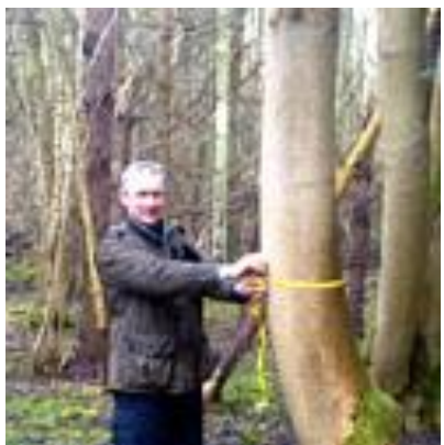
Forest Commission plans