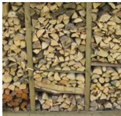
wood as fuel

What experience do you want? click a word