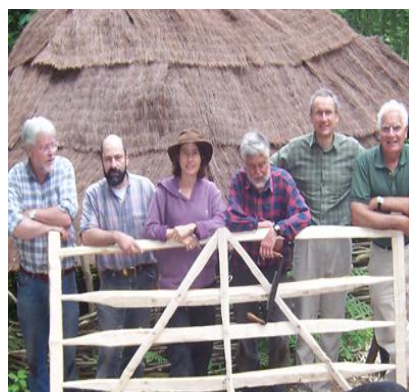
splitting wood for fencing