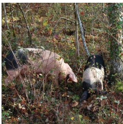
things to do with your woodland